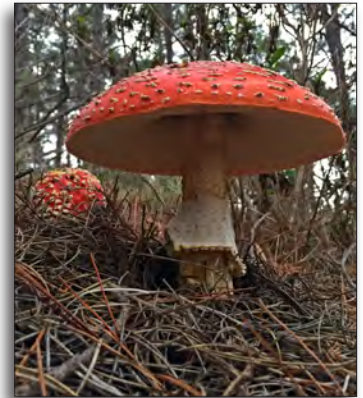
Amanita Muscaria