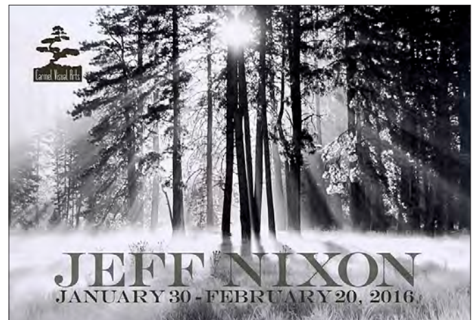
Cook's Meadow, Yosemite Valley