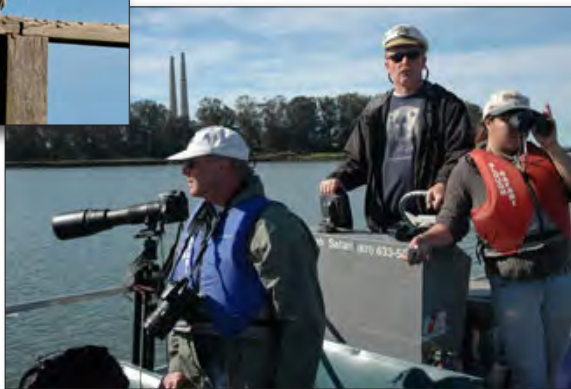
Elkhorn Slough